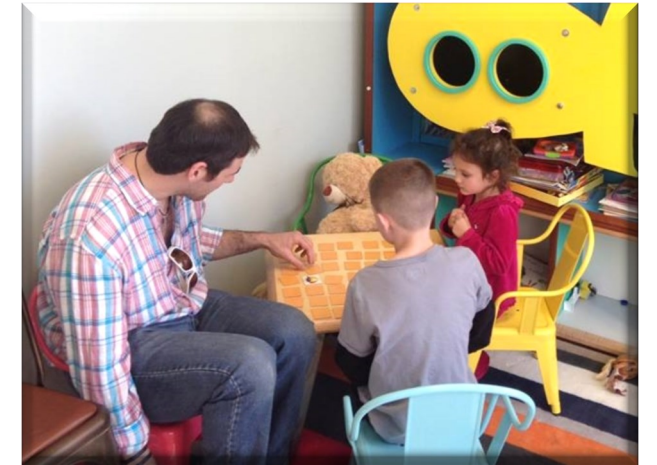
Your gifts provide the counseling children need to heal after trauma.

I think of you when I see the families coming through our new front door and hear the happy sounds of children playing in our welcoming new lobby. You have made this possible.